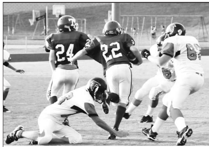
Indians defend the pass