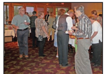
Animal lovers gathered during the weekend to benefit the Mountain Animal Shelter's no kill facility.

Sometimes, the shelter sends animals to other "no