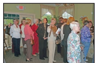
Animal lovers gathered on Friday at Enrico's to benefit the Castaway Critters' no kill facility.

Castaway Critters' primary goal is helping sick