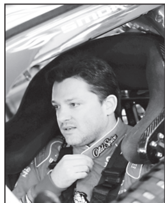
I'd tell them it's the lack of excitement during the races.

I make my living writing about NASCAR, but yesterday I became painfully aware of how much NASCAR racing has lost its lustre.