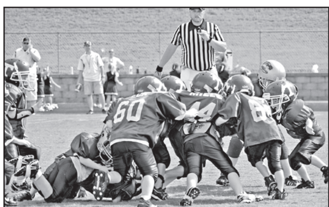
The Towns County Termites took care of business again with a 39-0 win.