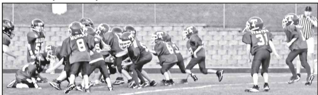
10 year old Indians head for a score.