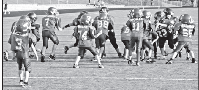
10 year old Indians hold the Pickens County Dragons at bay.