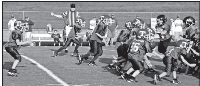
10 year old Indians drive for another score.