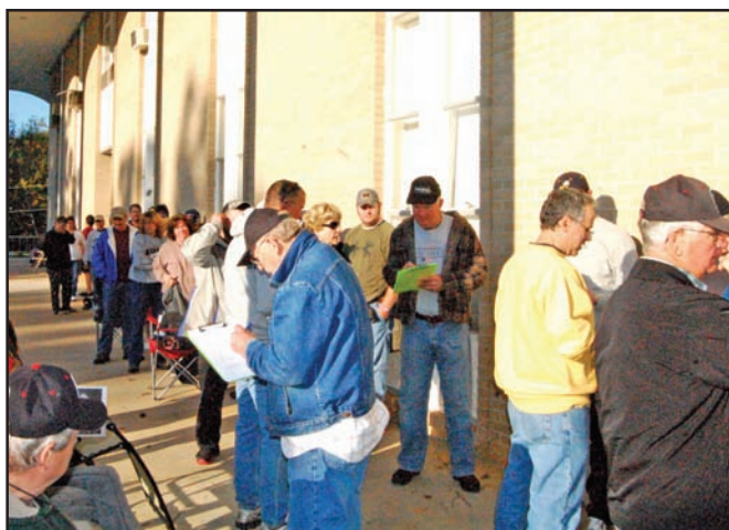
The crowds were tired and weary on Saturday. Hundreds waited until the 1 p.m. cutoff time.

On Friday, those same campers came and got in