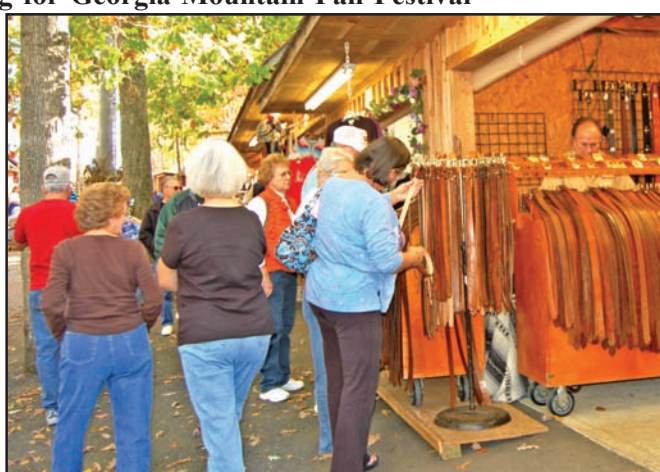
Fall Festival goers didn't have trouble finding a bargain. The crowds, like the bargains, were abundant.