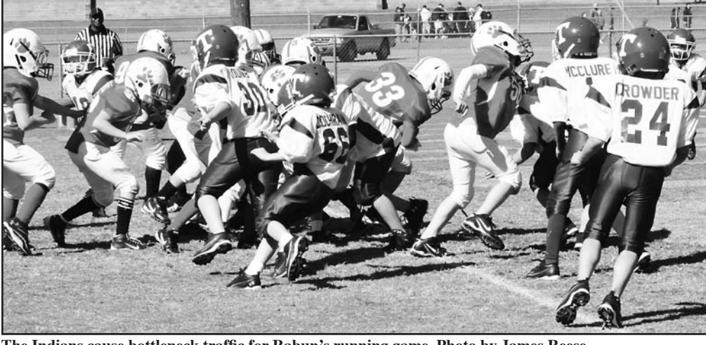
The Indians cause bottleneck traffic for Rabun's running game.