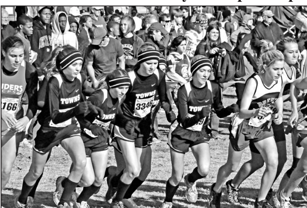
The Lady Indians are off and running in the Class A Cross Country Championships.

claimed the state title; followed by Wesleyan, First Presbyterian, and Darlington.