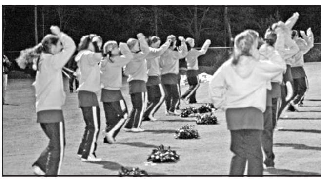
Towns County Cheerleaders cheer on Indians in Dacula.