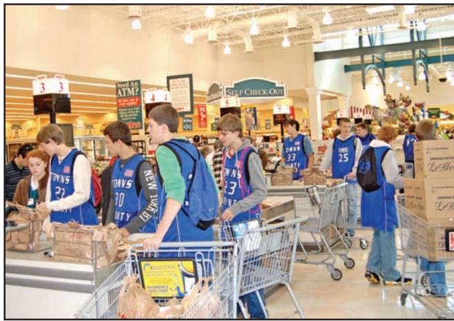
Varsity Indians Basketball players raised $2,600 by bagging groceries on Saturday at Ingles of Hiawassee.

The Lady Indians tipoff with the Lady Wildcats at 6 p.m., followed by the Indi-