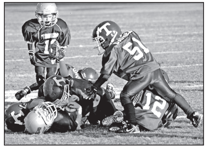
The Termites put a stop to the Tigers quarterback on Saturday in playoff action.

Saturday morning the Lady Indians appeared in the 2010 Georgia State Cross Country Finals held in Carroll-