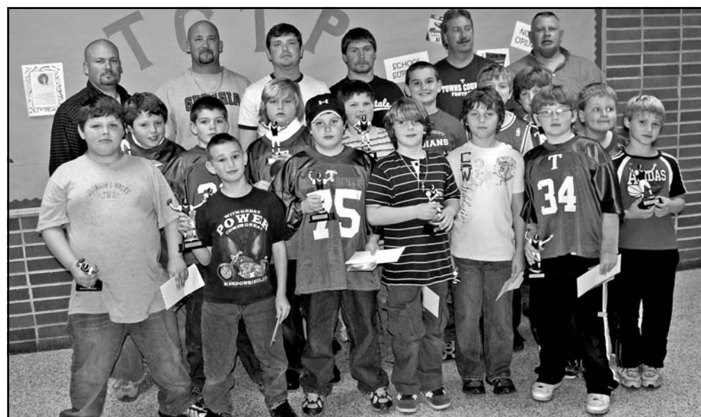
Junior Pee Wees Youth Football players honored.