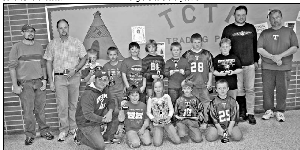
Termites Youth Football players honored.