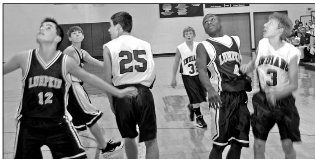
TCMS Boys lost a heartbreaker to Lumpkin.