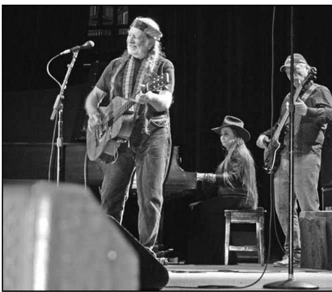
Willie Nelson performs Always on my Mind as a packed house at Anderson Music Hall sings along. Nelson sold out The Hall for the Halloween night performance.

Others came to see a country music legend in the flesh. For fans in these categories, along with all of the others in between, fortunate enough to attend the sold out concert, the Halloween spent with Willie Nelson is not one that will escape from their memories anytime soon.