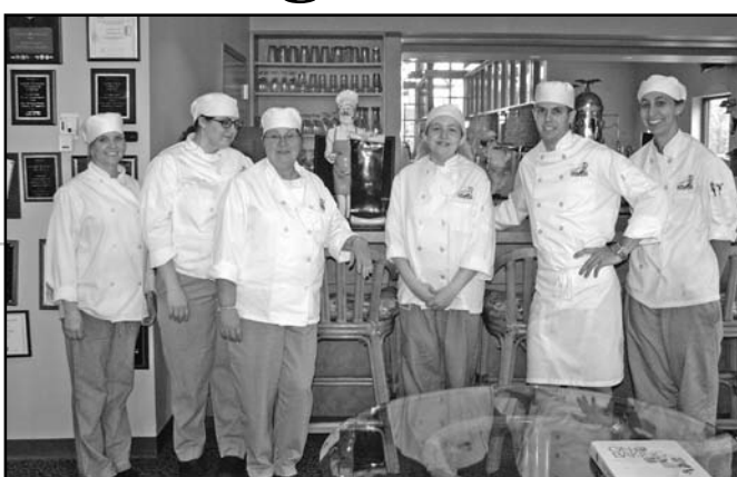
NGTC Culinary Arts students served up another batch of traditional Southern cuisine during the 11th Annual Chicken and Grits event at the Blairsville Campus off Georgia 515.

only eight culinary programs in the state, offers an Associate's Degree and or an Applied Technical Science Degree.