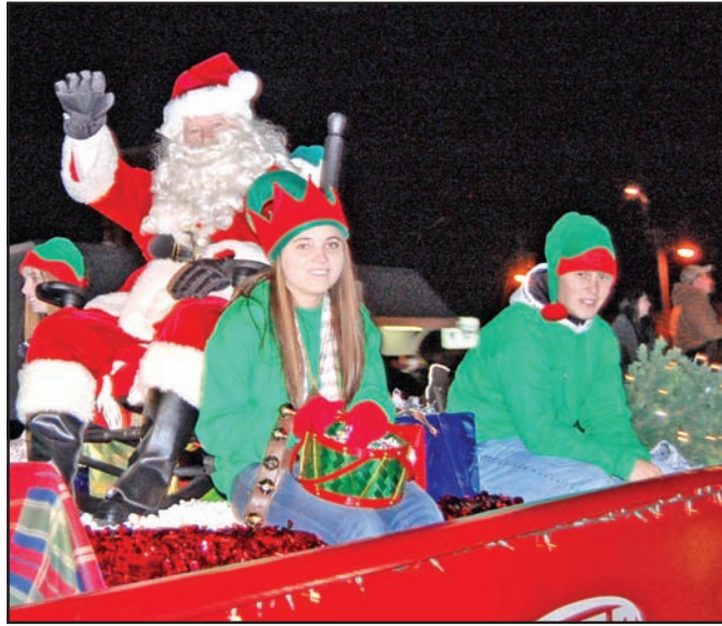
Santa and his helpers arrive in Downtown Hiwassee on Saturday to take part in the Sheriff's Christmas Parade. p.m. start. However, the parade didn't make it Downtown until the 6:15 p.m. mark.

For the most part, Saturday's event helped Christmas get a head start in Hiwassee. The crowd began to gather around 5 p.m. in anticipation of a 5:30