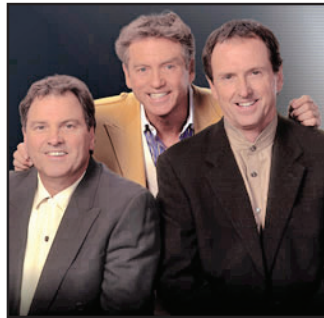
The Gatlin Brothers