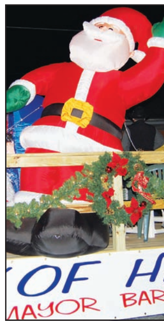
The Real Santa was at the Parade too.

The sheriff's elves have let him know that donations are at rock bottom, the effects of a dismal economy taking serious root in Towns County.