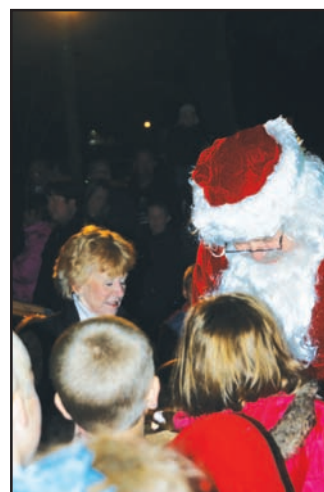
Santa greeted children in Young Harris on Friday during the tree lighting ceremony.

Santa led the children inside Young Harris City Hall, where he could sit beside the indoor Christmas Tree and listen to each child as they explained a list of toys that they would expect underneath their Christmas Tree on Christmas Morning.