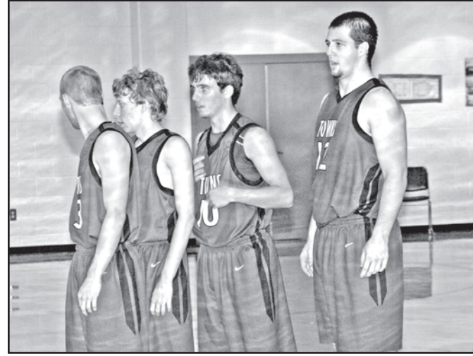
The Indians are primed to upset someone at the Battle of the States.