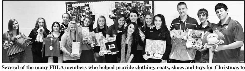
Several of the many FBLA members who helped provide clothing, coats, shoes and toys for Christmas needy children in Towns County. T(Dec22,G1)SH