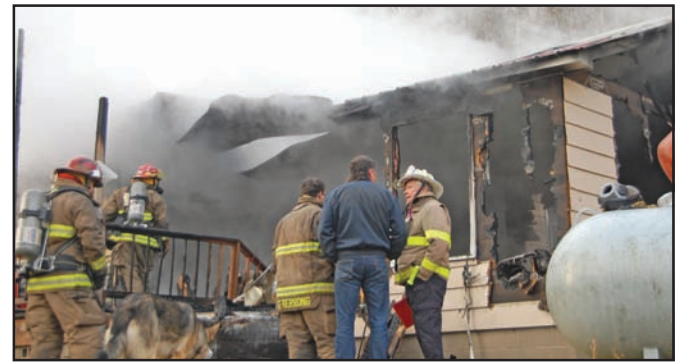
A fire at 581 Scataway Road claimed two lives in December.

On election night, Nov. 4 th , Towns County registered voters decided to give themselves a tax break. When it was all said and done, 1,899 Towns County voters came to the local polls. Of those totals, 1,806 supported an amendment that Towns County homeowners with local exemptions the only county in Georgia with a $10,000 tax break. Only 52 voters didn't want a tax break. The vote increases