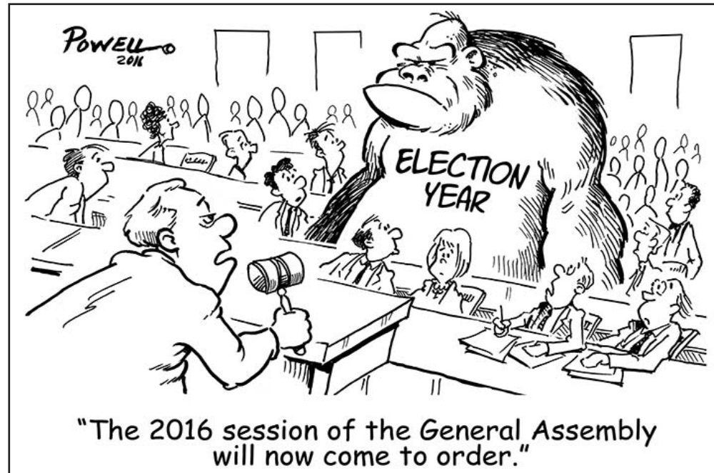
"The 2016 session of the General Assembly will now come to order."