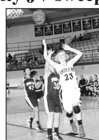
Towns County's JV teams swatted the Falcons.