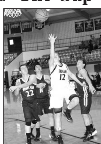
Towns County's JV teams swatted the Falcons.

This was also their second victory over the Falcons with the significance being that the Indians could use all players dressed for the game as much as needed with no Indian varsity game to follow