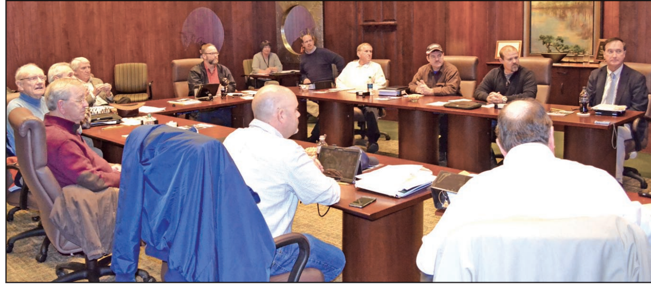
The Blue Ridge Mountain EMC Board of Directors entertain the media in a Question and Answer session before commencing the first meeting of the New Year in the BRMEMC boardroom

On Tuesday, Jan. 12, members of the news media were invited into the BRMEMC boardroom to ask