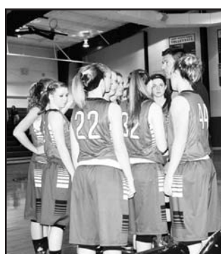
Towns County time out

Cowart and Cochran then matched George Walton baskets at 2:30 for a 55-53 score and at 1:36 for a 57-55 score with a Patton free throw at the one minute mark getting the Lady Indians within 57-56. That would turn out to be the Lady Indians' last point, however, with the Lady Bulldogs adding a free throw of their own at 43.0 seconds for a 58-56 score that would hold up for the win. The Lady Dogs left the door open for the Lady Indians when they missed a one and one free throw attempt at 18.8 seconds but the game ended after the Lady Indians were charged with a disputable charging foul at the 1.1