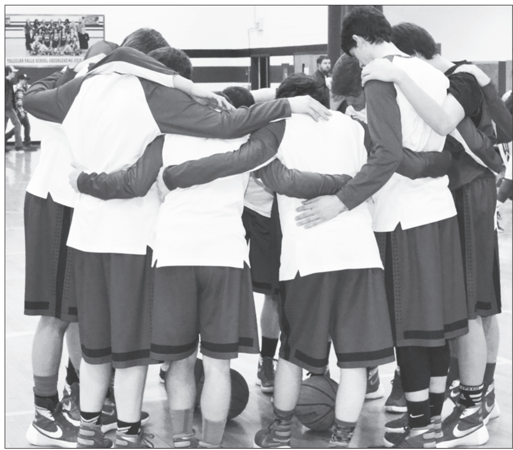
The Towns County guys getting ready for their game at Tallulah Falls.