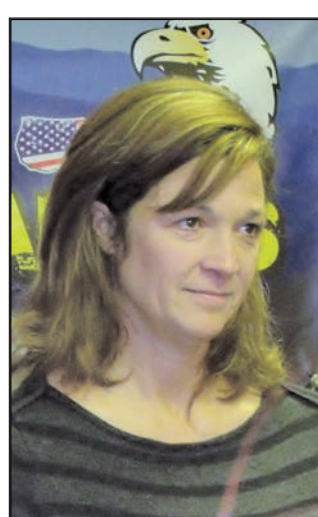
Mayor Andrea Gibby

By Azure Welch Towns County Herald Staff Writer