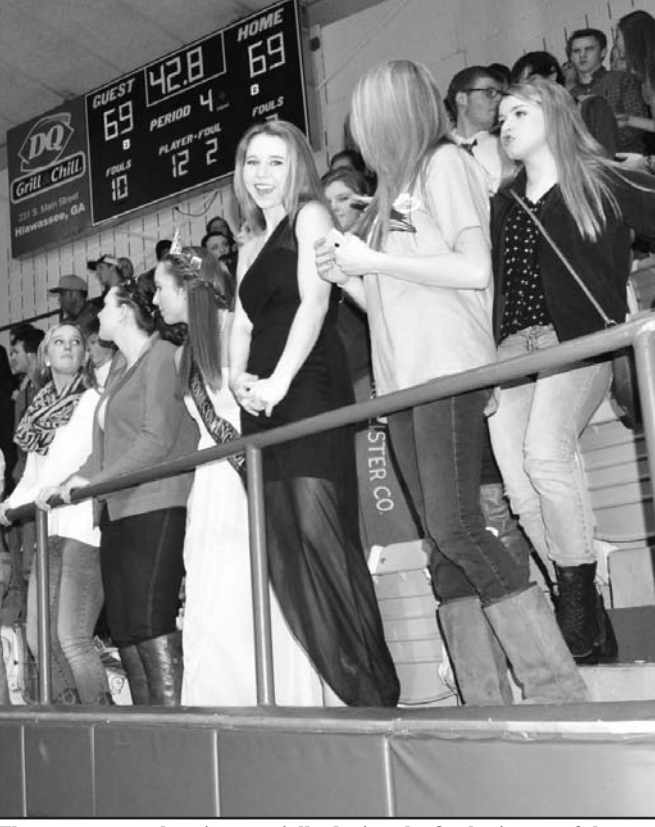
The energy was electric, especially during the final minutes of the Indians' Homecoming showdown with RMA.