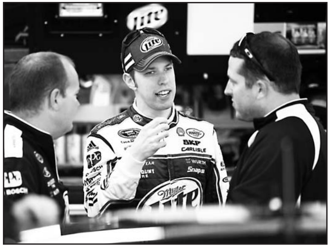
Brad Keselowski at New Hampshire in 2013.

have liked to have won more than we did last year, but I feel like we're fighting the good fight and doing some great things as a team that I'm really, really proud of.