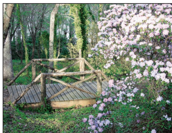
Hamilton Gardens was recently chosen as an All-America Selections Display Garden.

"I hope everyone will stop by the gardens to enjoy these wonderful display gar-