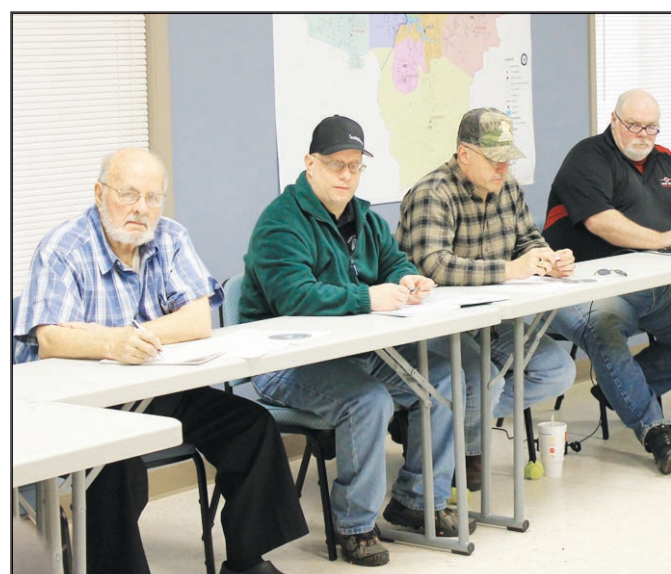
A recent series of emergencies has Towns County looking at ways to improve the county's emergency preparedness efforts.