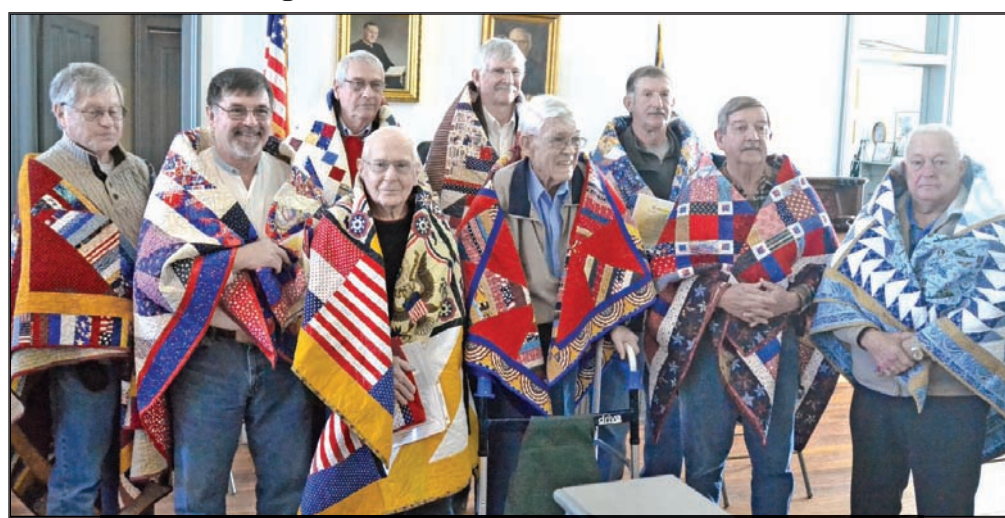
The nine honored Veterans who received Quilts of Valor from Misty Mountain Quilters Guild