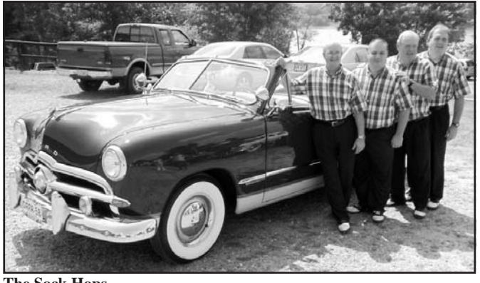
The Sock Hops

It is still possible to join us at the Peacock in Hayesville, NC Saturday night, February 20th at 7 p.m. and be transported back to the days when harmonies and doo-wop took center stage!