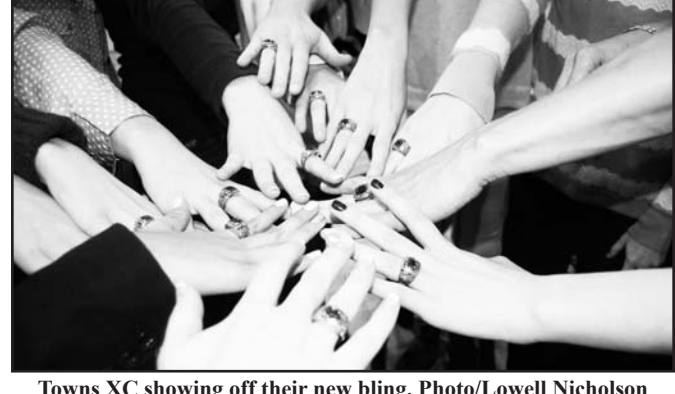
Towns XC showing off their new bling.

Congratulations to the Public Class A State Champions, the Lady Indians Cross Country team.