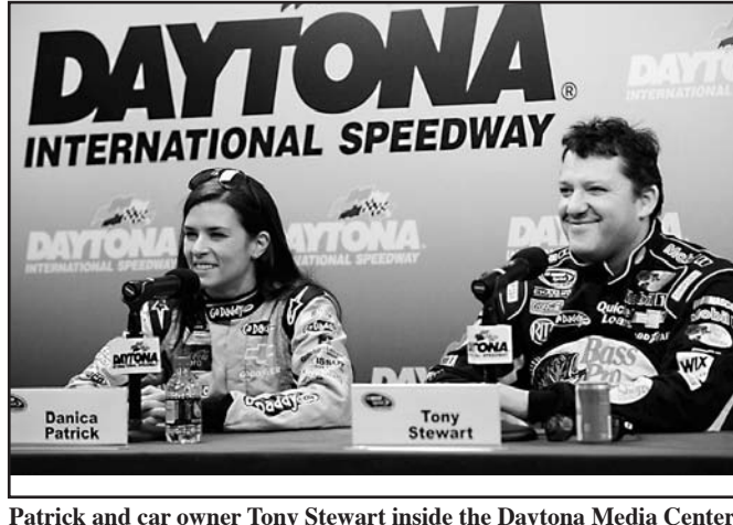
Patrick and car owner Tony Stewart inside the Daytona Media Center points). For the next two races, Phoenix and Las Vegas, 2012 owner points will be used.

Finally, position 43, last on the starting grid, will go to the most recent past champion not yet in the field. If there is not a past champion still not in, that position will be filled by the next driver eligible based on 2012 owner points.