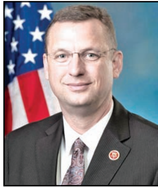
Rep. Doug Collins

The following is a letter sent by Congressman Doug Collins to telecommunication provider Windstream on Thursday, Feb. 11, regarding their unsatisfactory and substandard service to their customers in the Ninth District of Georgia. Congressman Collins is requesting information from the company, which received government money from the Phase II Connect America Fund, as well as preferred tax status from the IRS, on why their service continues to underperform in Northeast Georgia, despite the federal