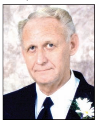
Towns County Sole Commissioner Bill Kendall

The County also passed the Vehicle Preventative Maintenance Policy and Procedures, which is a set of rules making it even safer for anyone in Towns County to use the transit system.