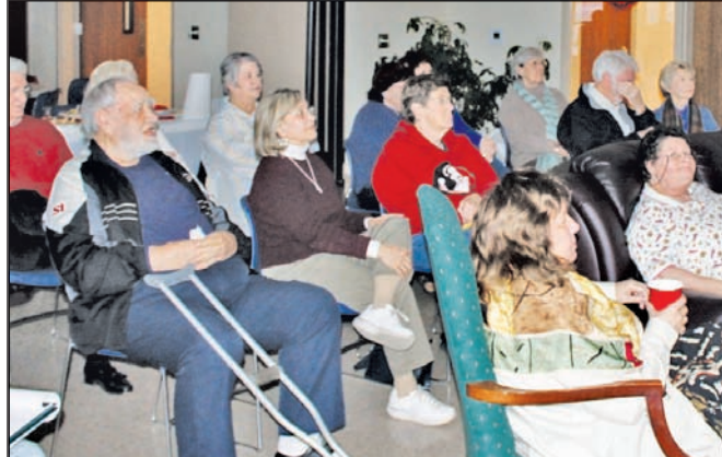
Towns County history enthusiasts enjoy a blast from the past at the recent Historical Society gathering.