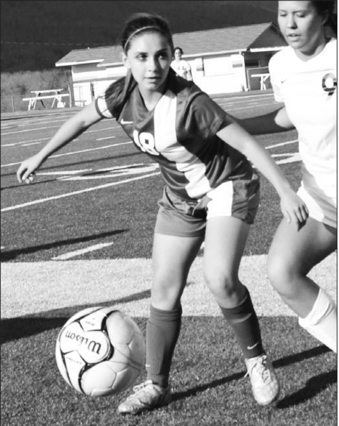
Towns County will host Union County on Monday. Last year, the Lady Indians handed their only regular season loss of the season before the Lady Panthers reached the Class AA Elite 8.

The Union boys tied Fannin, 1-1 and beat Greene 10-0.