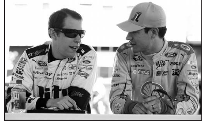
Teammates Brad Keselowski and Joey Logano

LAS VEGAS, Nev.-Penske Racers Brad Keselowski and Joey Logano finished 1-2 in Sunday's 267-lap Sprint Cup race.