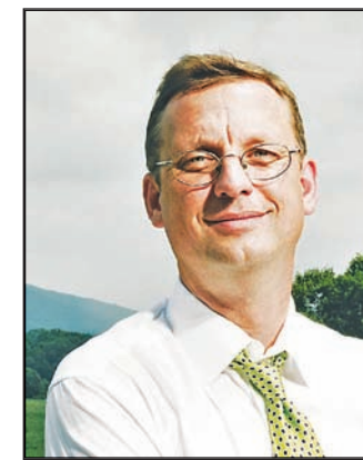
U.S. Rep. Doug Collins