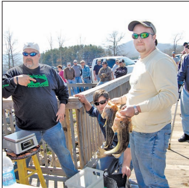
The Towns County Touchdown Club's annual Bass Tournament is expected to draw a crowd of anglers on Saturday.