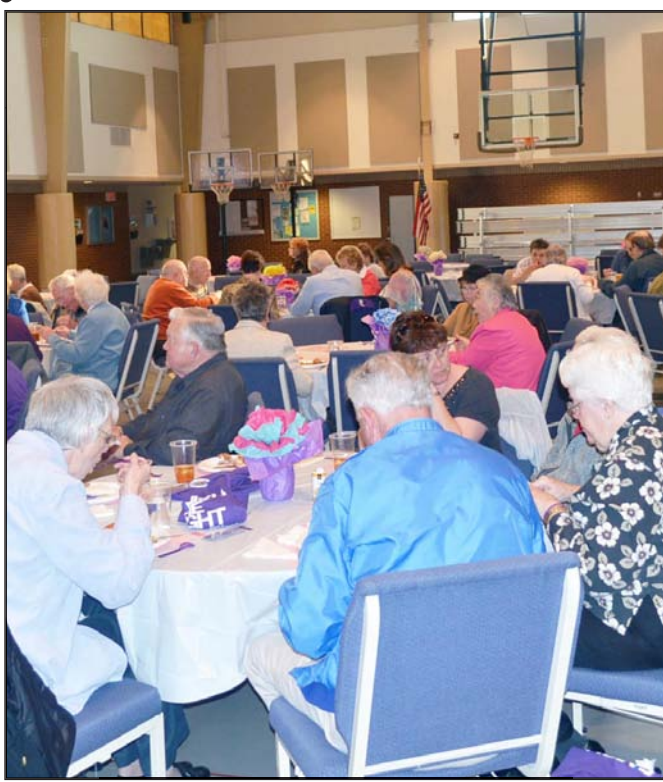
McConnell Memorial Baptist Church was packed Thursday evening as the Annual Relay for Life Survivor Celebration took place.