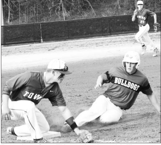
Towns takes on George Walton Academy last week in Hiawassee. The Indians will be back home on Friday.

Be sure to head to the games to support the Towns County baseball program.