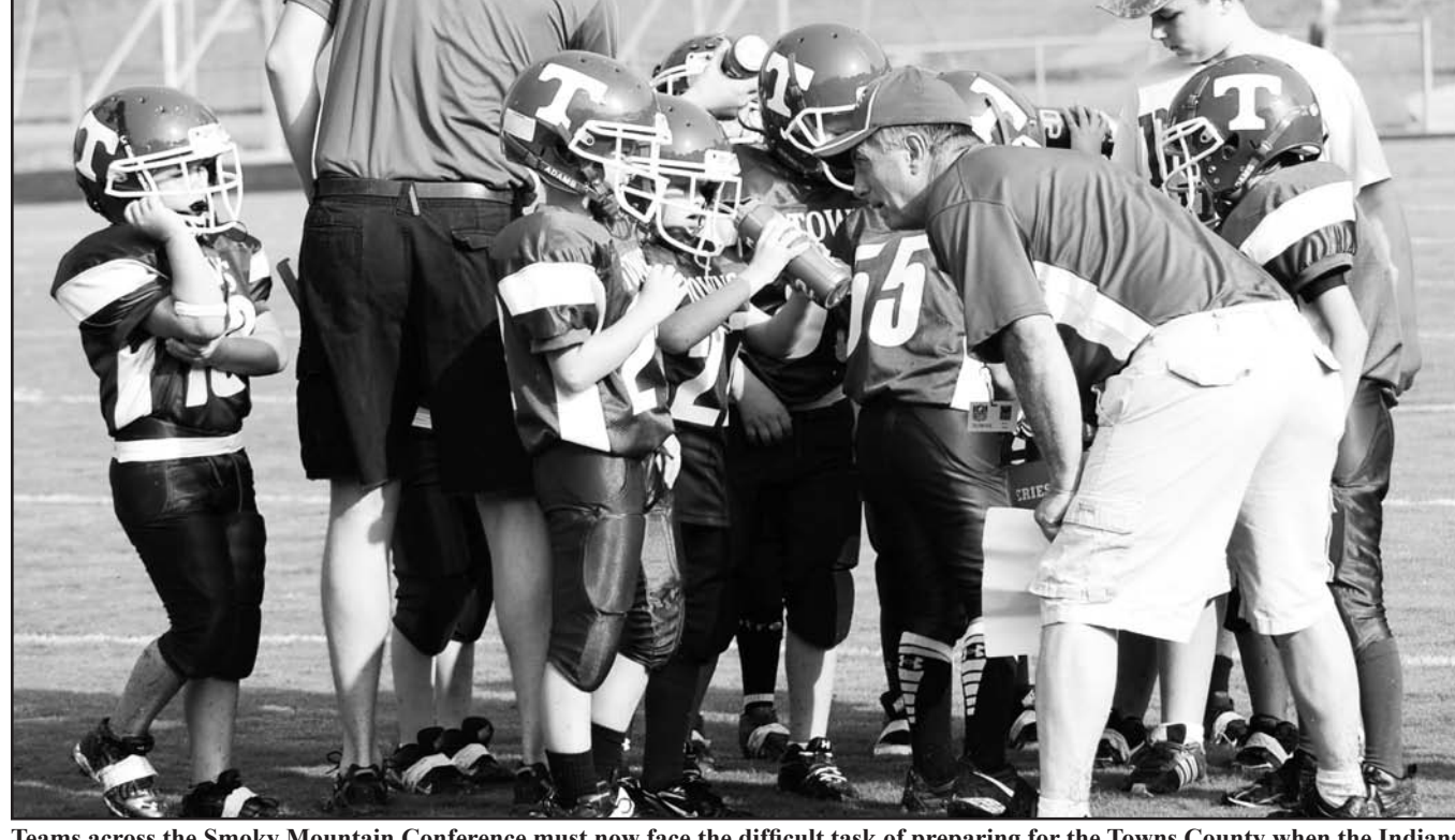
Teams across the Smoky Mountain Conference must now face the difficult task of preparing for the Towns County when the Indians jump into the mix in this coming fall.

numbers came out early this year, Towns County High School is