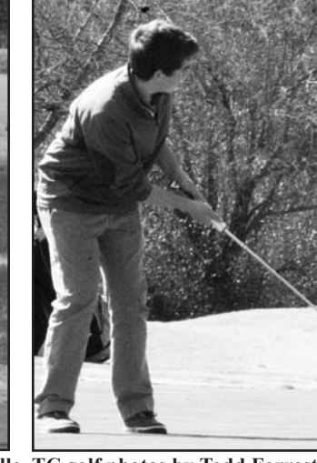
Towns County High School golfers at the Tri-County Cup held at Old Union Golf Course in Blairsville.

while the Spartans pounded out 17 hits, most coming in an 11-run second inning. In the second contest, Towns led 1-0 midway through the first but AA got four in the fifth and two in the sixth to blow open an 2-1 game. On Monday, Towns got three runs in the seventh but it