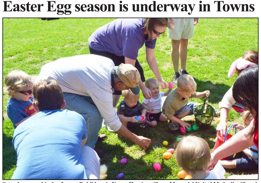
Saturday was a big day for small children in Young Harris as Sharp Memorial United Methodist Church hosted its first Easter Egg Hunt. The festivities happened at Mayor's Park.

involvement of blind and visually impaired residents in the social and economic life of Towns County."