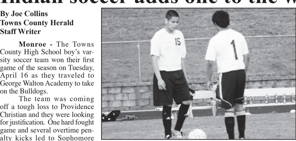
Towns soccer picked up its first win of 2013.

the final buzzer of regulation the performance was a stalemate sounded. Another key play was a great goal saving effort by junior defender Nick Santisi during regulation time. The offense had a few chances but none ever drew blood.