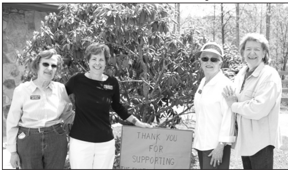
On Thursday April 21, the Enotah Garden Club hosted its yearly plant sale at Mayor's Park in Young Harris. The club is now 75 years old.