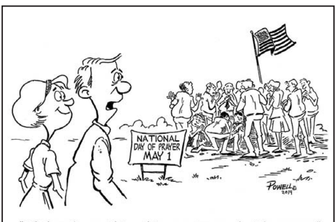
"If there's one thing this country needs, it's prayer."