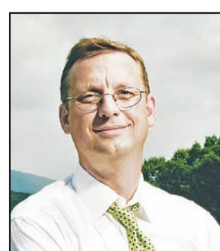
U.S. Rep. Doug Collins

This letter builds on issues addressed in Congressman Collins' February letter, after Windstream failed to make substantial improvements. Congressman Collins issued the following statement on the letter: