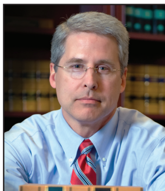
Judge Stan Gunter

The four-county Enotah Judicial Circuit includes Lump-