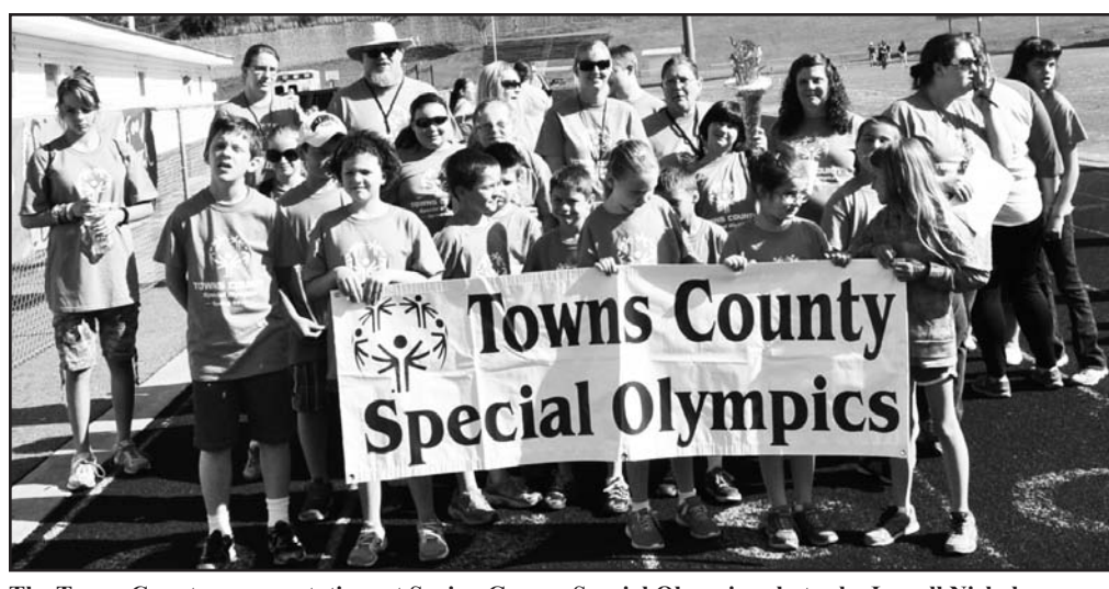
The Towns County representatives at Spring Games.