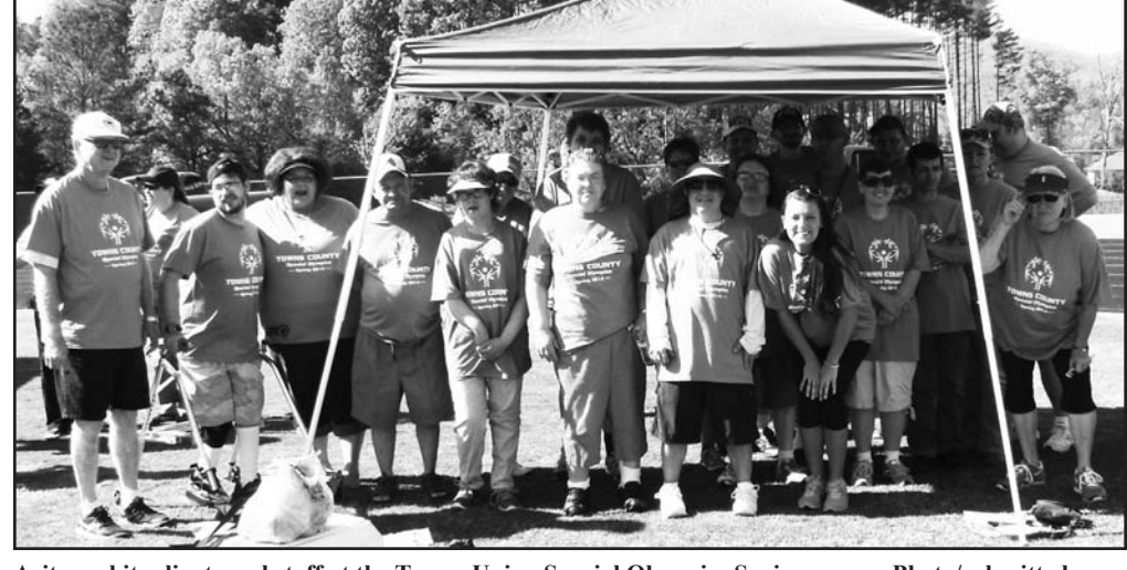
Avita and its clients and staff at the Towns-Union Special Olympics Spring games.

of the day. McConnell Memorial Baptist Church provided an excellent lunch as well as drinks to the thirsty athletes during and after the events. Many people volunteered from the church to make this an excellent meal for the athletes, their parents, and the staff.