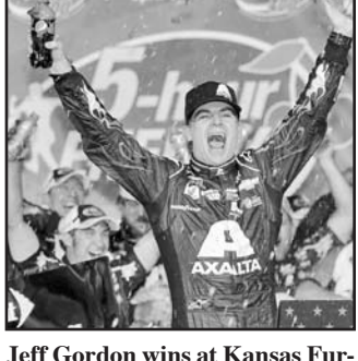
Jeff Gordon wins at Kansas Furnished by GM second.