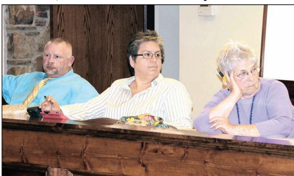
Confusion on the long faces of three Hiawassee city council members tells the story of what's happening at Hiawassee City Hall.