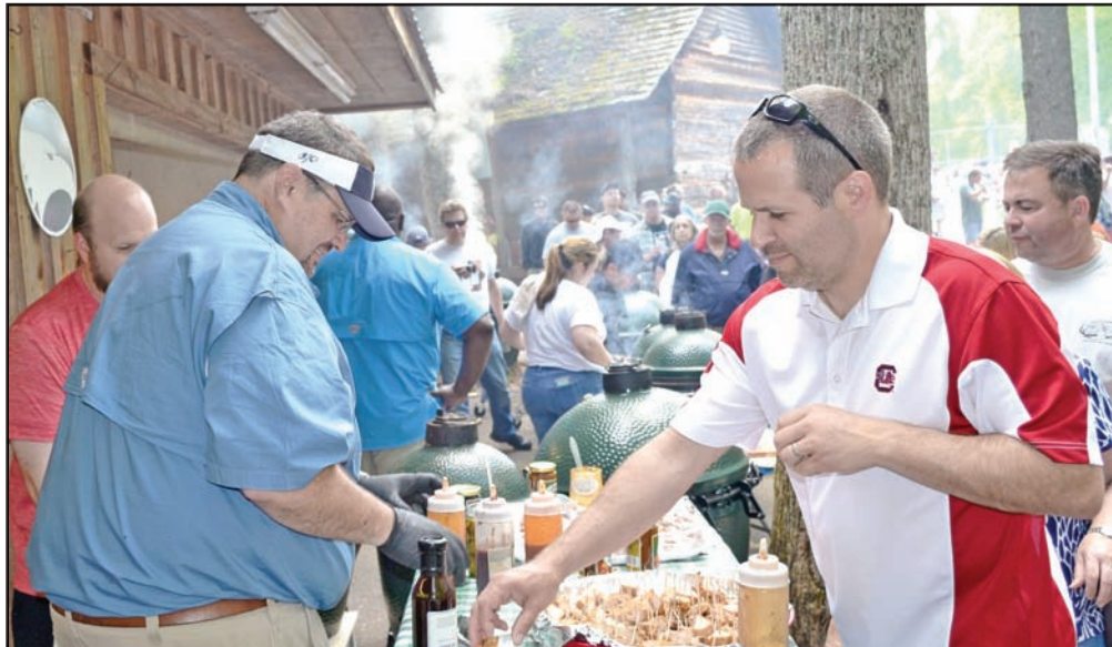
See EggFest, Page 6A