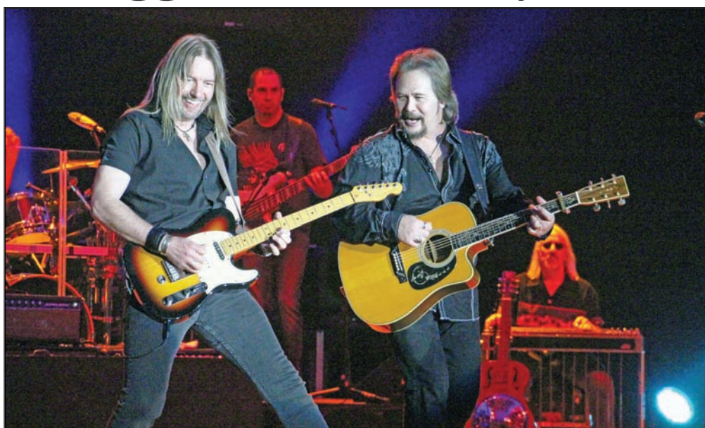
Georgia native Travis Tritt paid tribute to the recently departed Country Music Legend Merle Haggard at Saturday's concert in Hiawassee at Anderson Music Hall.

"For anybody that is an anti-God Country Music fan, you know that we've lost one of the greatest Coun-