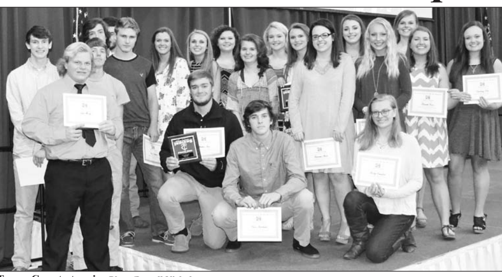
Towns County tennis.