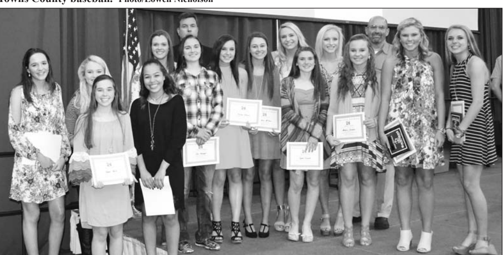
Towns County girls basketball.