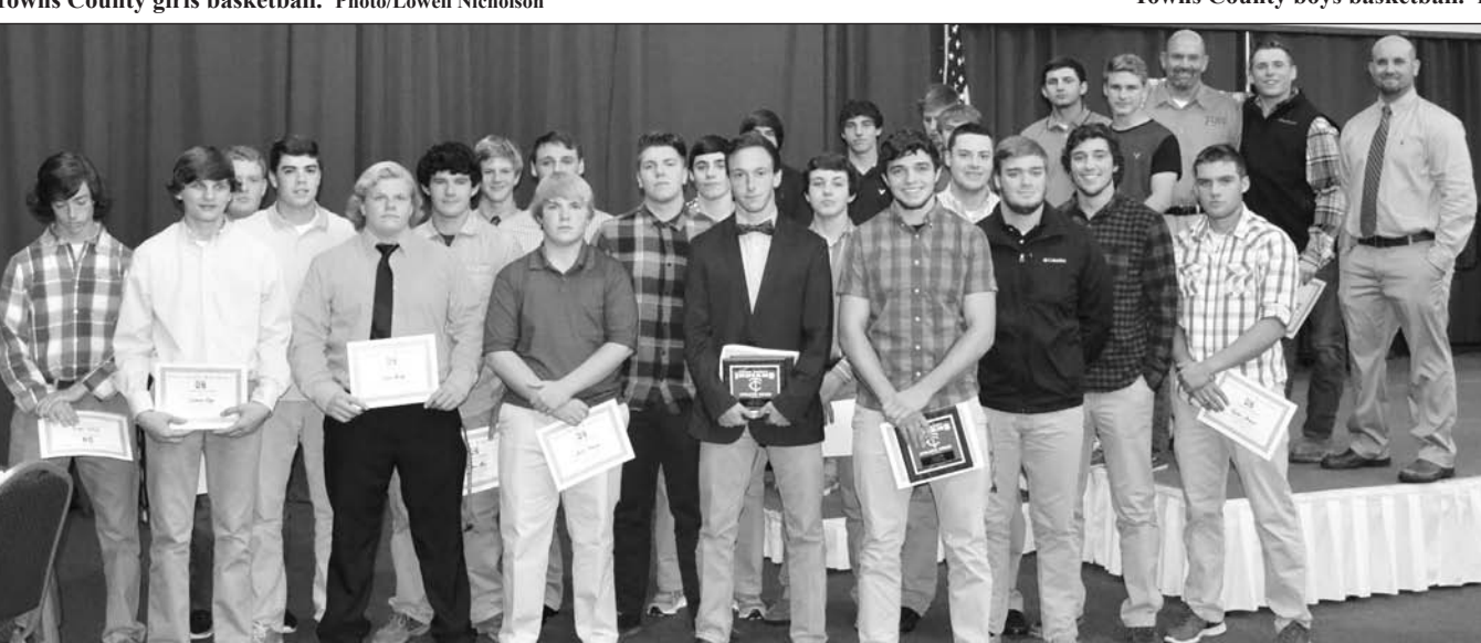
Towns County football. The remaining banquet photos will appear in next week's edition of the Towns County Herald