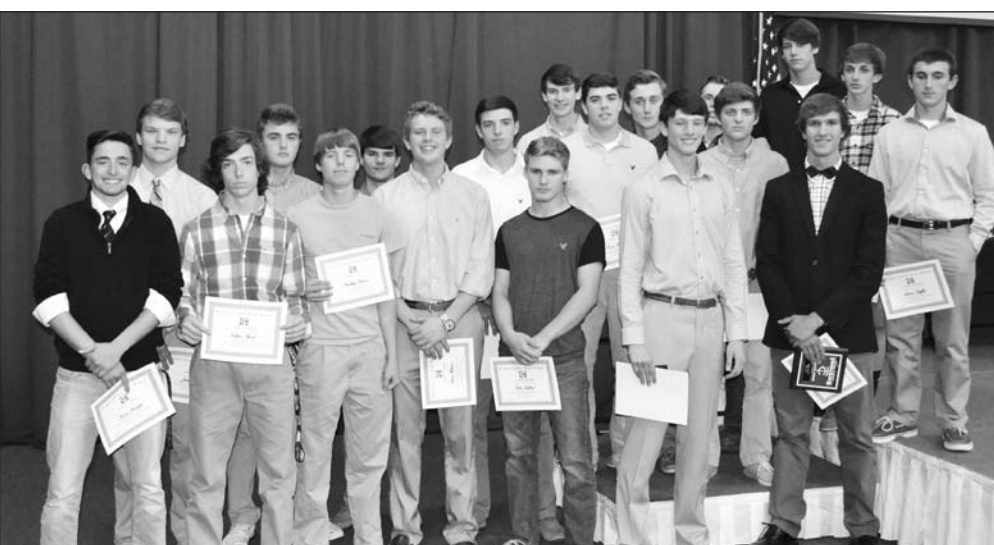
Towns County boys basketball.