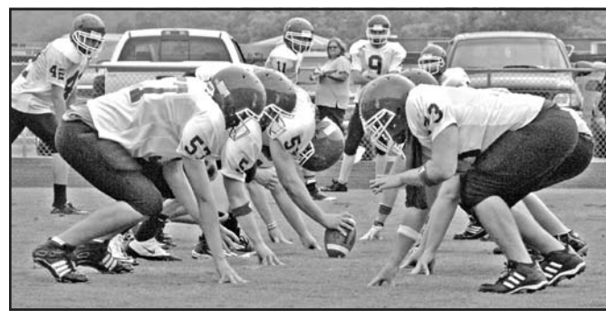
This game was decided in the trenches.

As the summer months approach, Coach Langford will yet again look to rely heavily on youth and in some cases inexperience. Coach Langford and staff were encouraged by