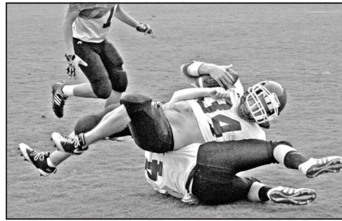
It's hard to believe it was just a scrimmage game, the contact was fierce.