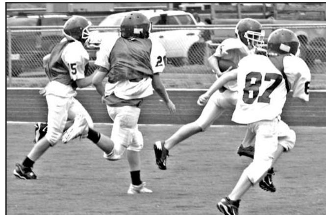
It was off to the races in the first Towns County Middle School Scrimmage.