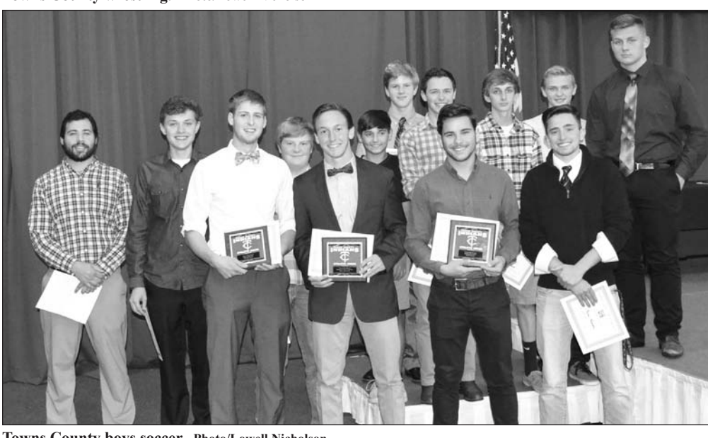
Towns County boys soccer.