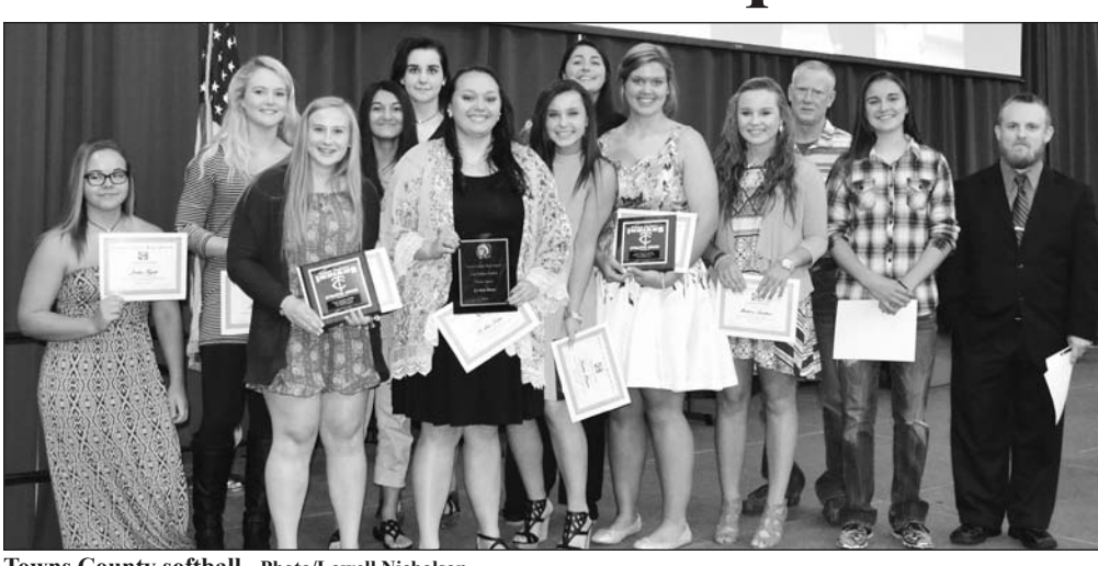
Towns County softball.