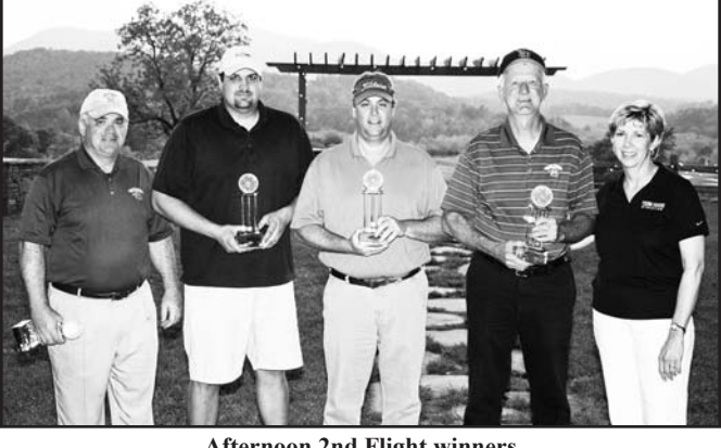
Afternoon 2nd Flight winners