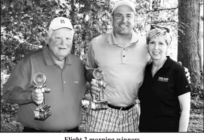
Flight 2 morning winners