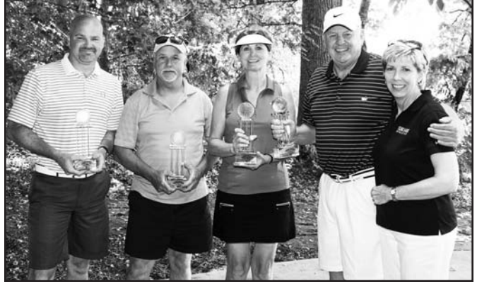
Flight 1 morning winners