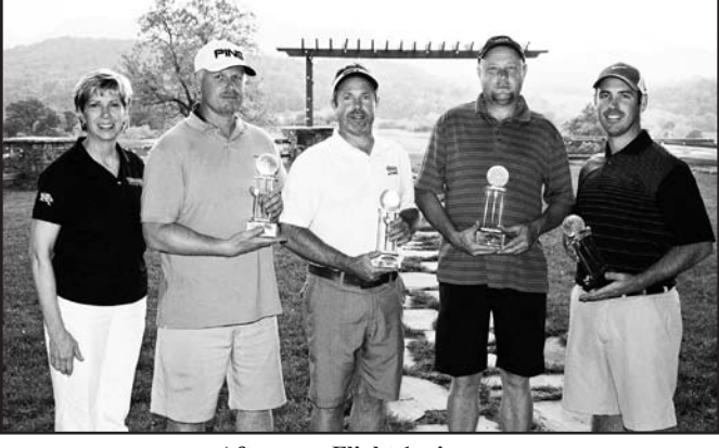
Afternoon Flight 1 winners