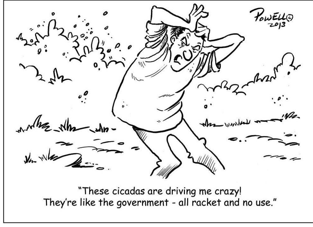
"These cicadas are driving me crazy! They're like the government - all racket and no use."

20# COPY PAPER now available at The Herald 500 Sheets $3.80 5000 Sheets $36