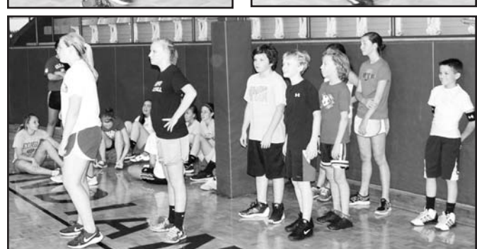
Towns County Basketball Camp