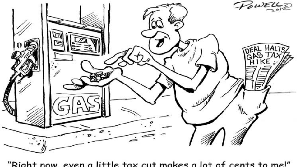
"Right now, even a little tax cut makes a lot of cents to me!"

Shooting Creek Basket Weavers meets the 2nd Wednesday of every month at 10 a.m. at the Shooting Creek Fire Hall Community Center. All welcome. For more info www.shootingcreekbasketweavers.com.